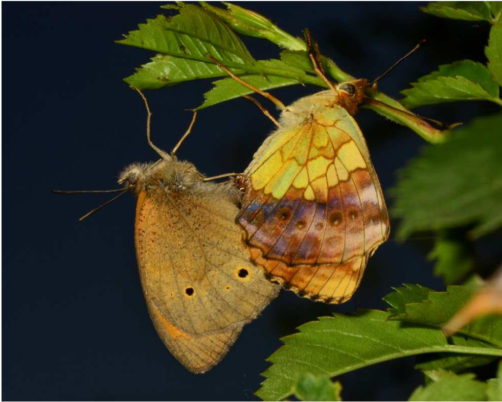
Interspecific pairing of a Maniola jurtina male and a Brenthis daphne female, Mt. Vernon, Florina, Greece.

Lazaros Pamperis reports in the Entomologists's Gazette 2012 (vol 63, Page 52) a very unusual pairing of butterflies on Mount Vernon he observed last year and has kindly shared the photograph with us. It is Meadow Brown ( Maniola jurtina ) mating with Marbled Fritillary ( Brenthis daphne ) female. He observed them for 45 minutes during which time a male Brenthis daphne tried to mate with the female. They flew off still in cop.