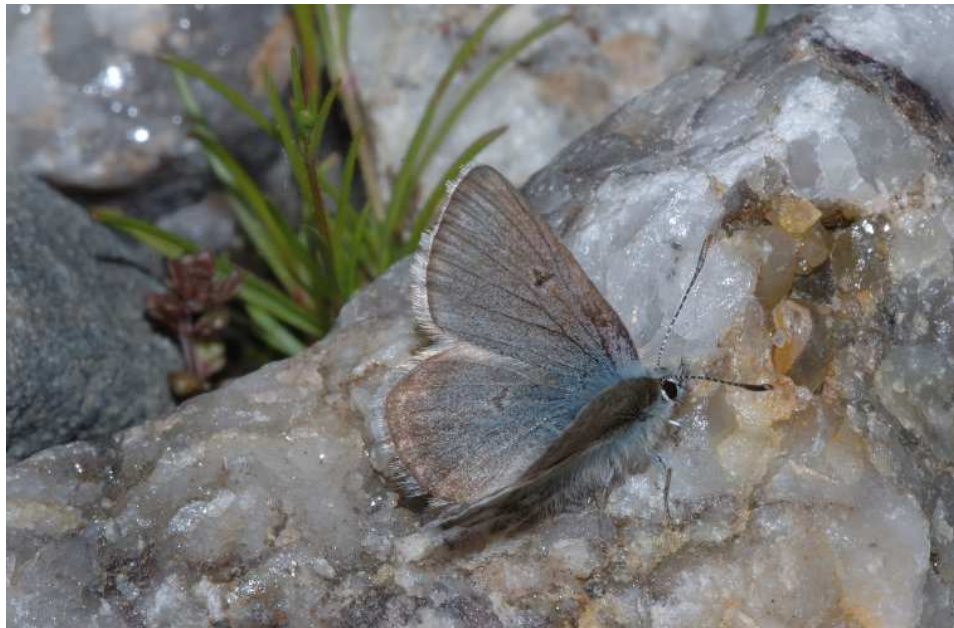
Arctic Blue ( Agriades aquilo )

zulichii . Accordingly, we set off on a long track up the mountainside just after 7.00am, as dawn was breaking. After several km, we met two friendly shepherds by a very welcome spring-fed drinking fountain. The track continued up to a pass below a much steeper ascent to the summit.