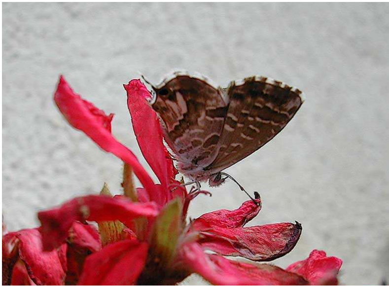
Geranium Bronze ( Cacyreus marshalli)