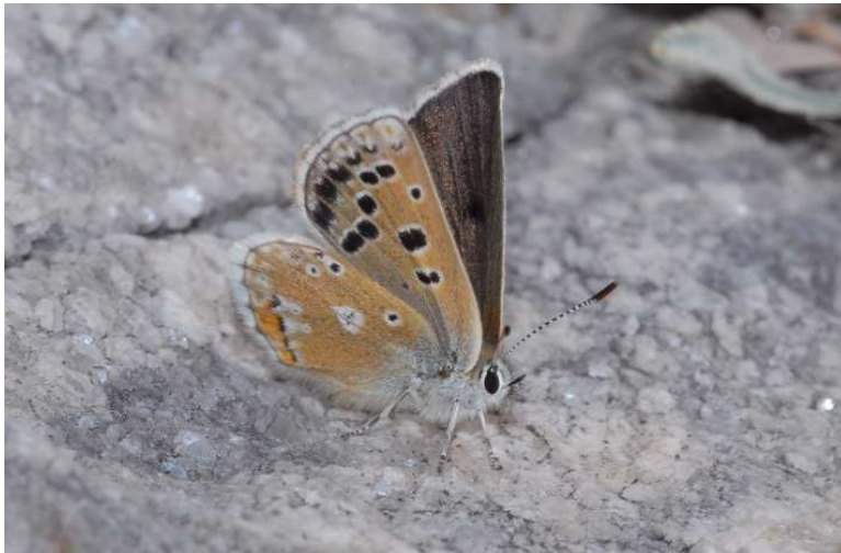
Bosnian Blue ( Agriades dardanus )

A small group of 'blue' butterflies that are associated with high altitudes (or, in one case, the far north) have caused quite a bit of confusion. The Collins Guide (Tolman & Lewington 2008) puts them together in the genus Agriades . In all taxa, the males have predominantly silvery uppersides, with black discal spots and more or less dark shading distally. The females are mainly plain dark brown on the uppersides. The undersides have bold black spots on the pale ground colour, often with some spots on the hind wings absent (or reduced) and replaced by white patches. Tolman and Lewington 'lump' these taxa into two species – Agriades glandon (Glandon Blue) and A. pyrenaicus (Garvarnie Blue). The northern form, aquilo (Arctic Blue), and the southern form, zulichhi (Zulich's Blue), an endemic of the Sierra Nevada, Spain are both treated as subspecies alongside the more widespread alpine Glandon blue ( Agriades glandon glandon ). The Gavarnie blue ( Agriades pyrenaicus ) is, in turn, split into three subspecies – asturiensis , widespread in mountains of northern Spain, pyrenaicus , from the Pyrenees and dardanus , a very localised inhabitant of the Balkans. Lafranchis retains the generic name Agriades and puts asturiensis into the same species as pyrenaicus , but separates aquilo and zulichhi from glandon , and treats dardanus as a distinct species from pyrenaicus .