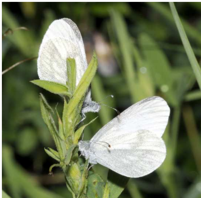
Wood White ( Leptidea sinapis )

It will be convenient to refer sometimes to the trio of sibling-species as the sinapis -siblings.