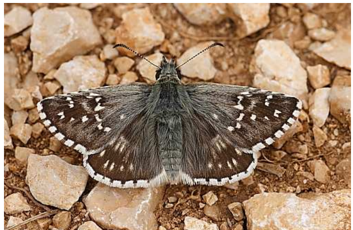
A male Safflower Skipper ( Pyrgus carthami )

They all have the same basic pattern of markings and seven of these species have reasonably unique features that enable their confident identification. The other seven (termed the "difficult 7") are harder to differentiate: alveus , armoricanus , carlinae , bellieri , cirsi , onopordi , and serratulae . Some have marks or features that are often described as characteristic, a word used to signify that it is unique to that species. However, many of these characteristic features are not always constant; if present and "classic", they can serve to identify the species with some degree of certainty, but these marks may vary and in a number of cases there exists some overlap between species. One example is the upperside forewing cell spot of carlinae , often described as "C-shaped" which it often clearly is, but it can vary considerably and in some cases is just slightly concave or angled.