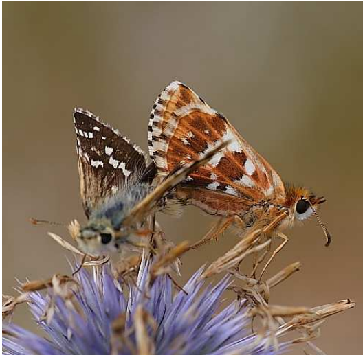
A pair of Cinquefoil Skippers ( Pyrgus cirsi ), female on the right

In the UK, identifying Pyrgus species presents no problems as only one species, Grizzled Skipper ( Pyrgus malvae ), occurs. In Europe, using the current classification that defines P. malvae and P. malvoides as separate species, sixteen species occur, and identifying them on the basis of appearance (rather than examination of genitalia) can be very difficult. They are one of the most difficult, perhaps the most difficult, groups to identify with any degree of confidence.