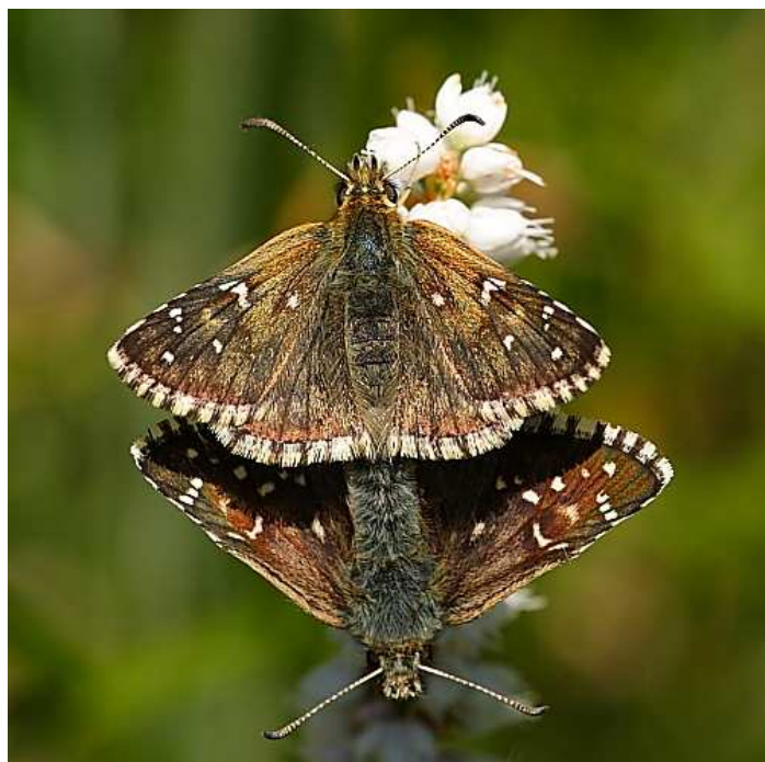
A pair of Carline Skippers ( Pyrgus carlinae ), female above

This article, and the links to the more detailed web pages (as it is far simpler to provide links than to reproduce the texts here), attempts to start a process to ascertain whether identification can be more confidently made by taking all indicators into account; initial findings suggest that this may be possible but, as with all things Pyrgus , it is rarely clear-cut.