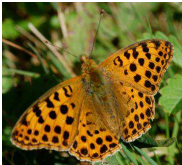
Queen of Spain Fritillary ( Issoria lathonia)

We were puzzled a day later, 26 April, on our first visit to the Frau Heathlands of the year, not to find Duke of Burgundy. Weather was fine and cowslips in excellent condition and we have found eggs and seen the butterfly here in previous seasons. I suspect this area of the Lot, being elevated and open to northerly winds, may be a little cooler than the Gourdon basin. This area of acidic heathland has always proved capable of delivering surprises but usually of a positive nature. As it was, we did see Queen of Spain Fritillary in rather poor condition that leads me to the conclusion that this species does, in some circumstances, overwinter as an adult. Small compensation for a disappointing butterfly day came in the form of good views of a Short-toed Eagle and an early sighting of Broad-bordered Bee Hawkmoth. Military orchid was added to the orchid list, somewhat surprising for this location.