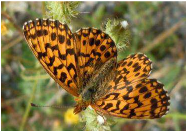
Weaver's Fritillary ( Boloria dia )

We enjoyed our first local walk on 18 April and saw both Swallowtail and Scarce Swallowtail, Brimstone, Orange Tip and Wood White; Small and Sooty Copper, Green Hairstreak and Small, Provençal Short-tailed, Green-underside and Common Blue, with Comma, Weaver's Fritillary, Small Heath, Wall and Speckled Wood also recorded. As well as the butterflies, we are blessed with a good range of orchids and Burnt tip, Lady, Early Spider and Sword-leaved Helleborine were noted.