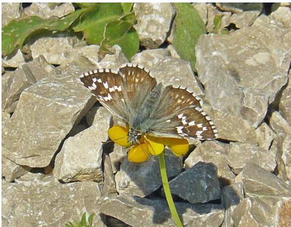
Safflower Skipper Pyrgus carthami Socerb, Slovenian karst, 2011

Enquiries to david.withrington@ntlworld.com .