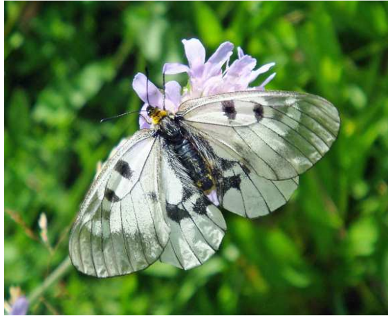
Clouded Apollo Parnassius mnemosyne Ratece, north-west Slovenia, 2011