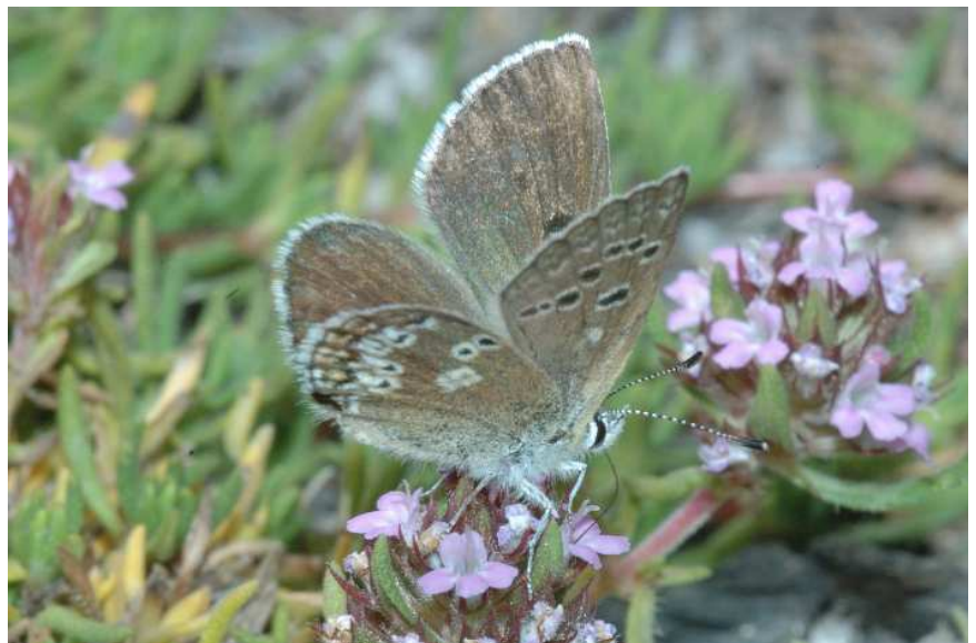
Zulich's Blue ( Agriades zulichii )

Butterflies emerged from nowhere – Idas Blue ( Plebejus idas ), a huge Purple-shot Copper ( Lycaena alciphron ), Polyommatus icarus , and several Aricia morronensis (the Spanish argus, another of our 'target' species for the trip). Eventually, on a rocky 'shoulder' we found zulichii – very small, and well-camouflaged against the grey rocks. The males seem to fly only in full sunshine, and in these exposed conditions fly very close to the rocks, occasionally stopping to nectar from thyme flowers. The females were noticed laying their eggs on the dense mats of the larval host-plant, Vitaliana primuliflora . The clouds soon closed in again, and we started on the 4-hour walk back down