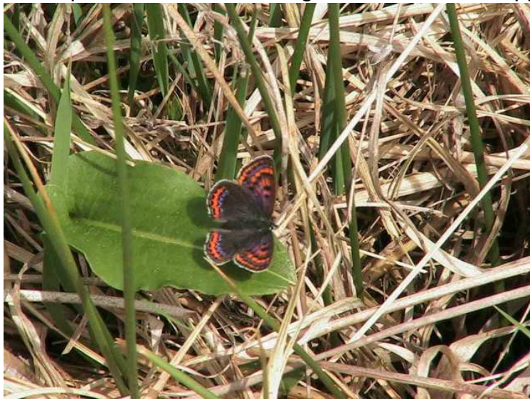
Violet Copper ( Lycaena helle )

The Violet Copper ( Lycaena helle ) and the Bog Fritillary ( Boloria eunomia ) are both red data book species, listed as in danger and the Violet Copper is listed under sections II and IV of the