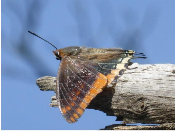
Two-tailed Pasha Charaxes jасius