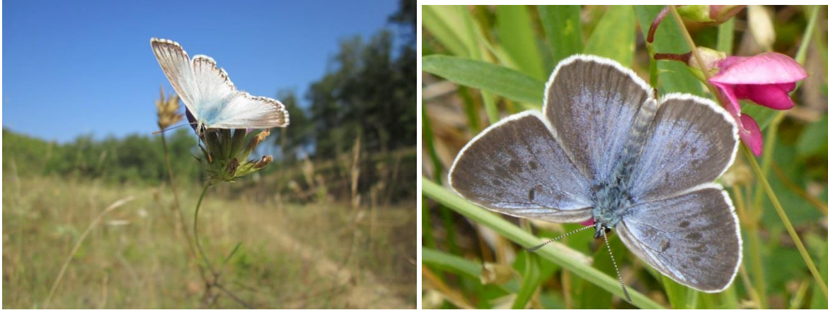
Provence Chalk-hill Blue Polyommatus hispana Large Blue Phengaris arion

In the spring and early summer there are many species to be found at low and medium altitudes. In July and August as plants and grass dry up at lower altitudes, the higher or more sheltered, moister locations are more productive. In September, although butterfly numbers are down on May and June, there is still plenty to see at all altitudes.