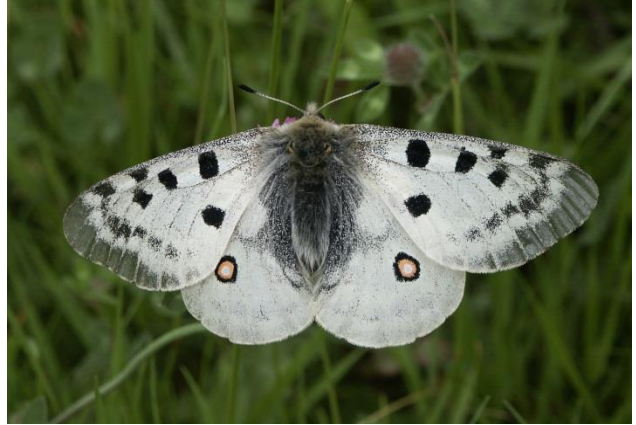
Apollo Parnassius apollo

Target species: Provencal Chalkhill Blue ( Polyommatus hispana ), Chequered Blue ( Scolitantides orion ), Two-tailed Pasha ( Charaxes jасius ) (I have only seen it twice in ten years), Portuguese Dappled White ( E tagis ) (I have only seen it once). Also to be seen from time to time is the Large Tortoiseshell ( Nymphalis polychloros ). In June the Ilex Hairstreak ( Satyrrium ilicis ), False Ilex Hairstreak S esculi ) and Blue-spot Hairstreak ( S spini ) are common.