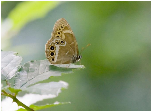
Woodland Brown Lopinga achine