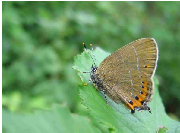
Black Hairstreak Satyrium pruni

Much of central Brenne can be of interest, walking the many paths near Chérine nature reserve can be rewarding (Camberwell Beauty ( Nymphalis antiopa ), Large Tortoiseshell ( Nymphalis polychloros ), many fritillaries, hairstreaks, skippers...). Other productive sites open to the public include the “Communaux” and “Champs de Foix” at Rosnay and the public footpaths around the Blizon village a little farther north.