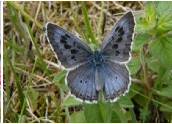
Large Blue Phengaris arion

Butterflies haven't been extensively studied here and there are probably undiscovered species to be found and new sites to be uncovered. If you come to the area and see some interesting species we should very much appreciate receiving your records that may well contribute to our knowledge and thus conservation efforts here. Whatever, I am sure that if you do come looking for butterflies and the weather is sunny and mild (as it often is), you won't be disappointed.