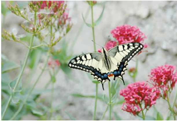
Swallowtail Papilio machaon