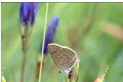
Alcon Blue Phengaris alcon

Nearby, a walk along the D21 road west of the “Carrefour du Gué Rossignol” may provide sightings of many species including Chequered Skipper ( Carterocephalus palaemon ), Pearly Heath ( Coenonympha arcania ), Map ( Araschnia levana ), Heath Fritillary ( Mellitea athalia ) and maybe even Duke-of-Burgandy ( Hamearis lucina ). The Dryad ( Minois dryas ) can be found, sometimes in large numbers, along tracks to the north-west of the forest; but this species flies late, in late July and August at a time when fewer other interesting species are active.