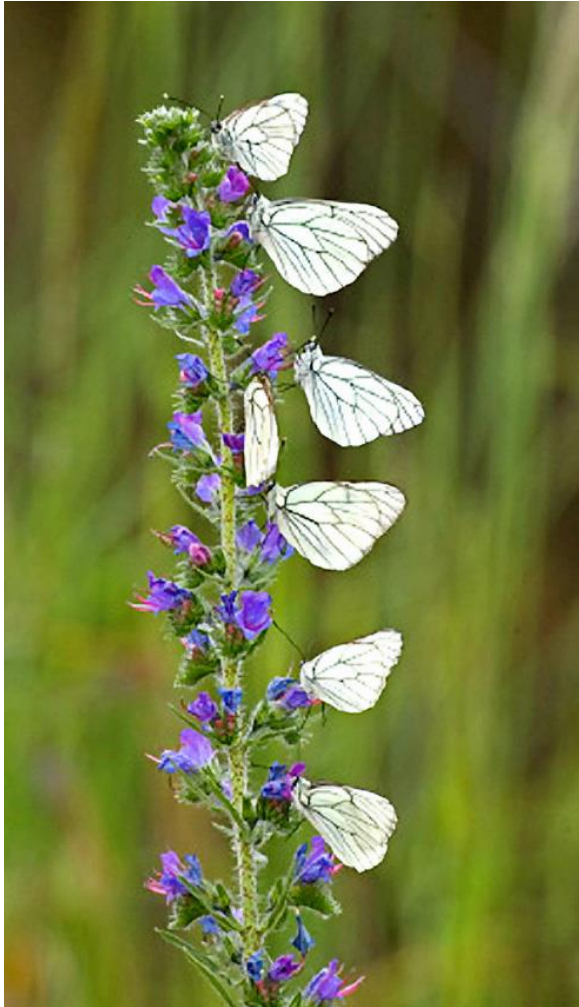
Black-veined Whites Aporia crataegi

There are many more sites and many more interesting species but space doesn't allow mention of them all. Nearly all the species that occur here can be seen using tracks or sites that open to the public. However, a handful of species only occur on private land and are thus difficult to see. Two species that spring to mind are Alcon Blue ( Phengaris alcon ) and Idas Blue ( Plebejus idas ); they occur at a few restricted sites here and can only be seen during accompanied outings organised by the LPO.