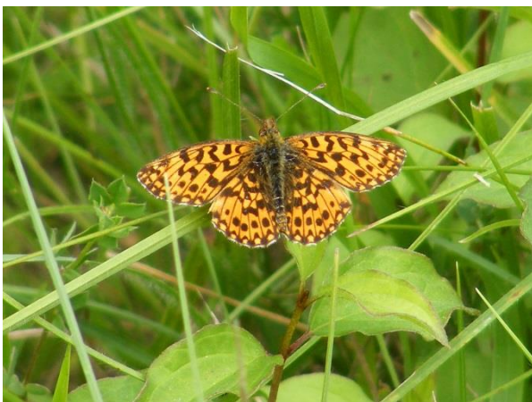
Weavers Fritillary Boloria dia

Weaver's Fritillary ( Boloria dia ) is by far the most abundant species of Fritillary. It also has the longest flight season, having 2 -3 generations from April to October, and can be found in numbers anywhere its host plants Violets ( Viola ) spp grow.