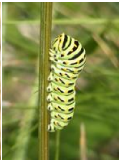
Swallowtail Papilio machaon