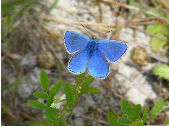
Adonis Blue Polyommatus bellargus