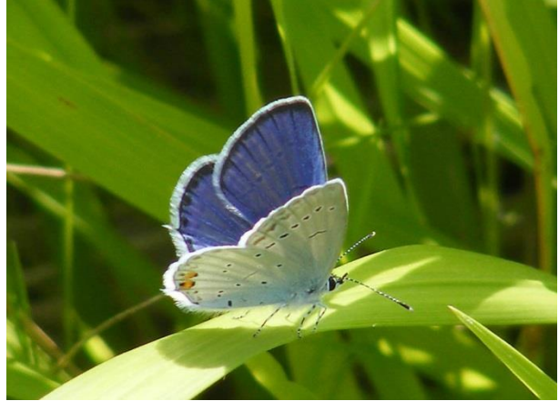
Short-tailed Blue Everes argiades