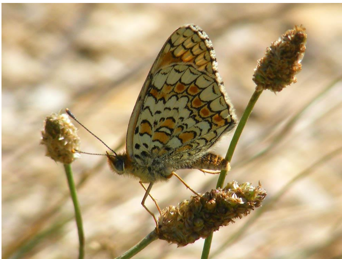
Knapweed Fritillary Melitaea phoebe

Scarce Swallowtail ( Iphiclides podalirius ) and Swallowtail ( Papilio machaon ) common, the former being much associated with gardens and orchards, the latter is seen nectaring on flowering crops such as lucerne and at wild flowers on forest margins. Check cherry trees in orchards and gardens for caterpillars of Iphiclides and French Hog's-fennel ( Peucedanum gallicum ) for caterpillars of Papilio .