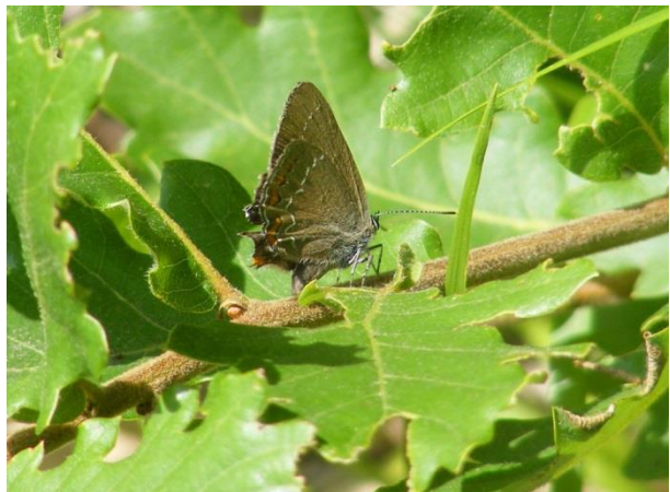
Ilex Hairstreak Satyrium ilicis